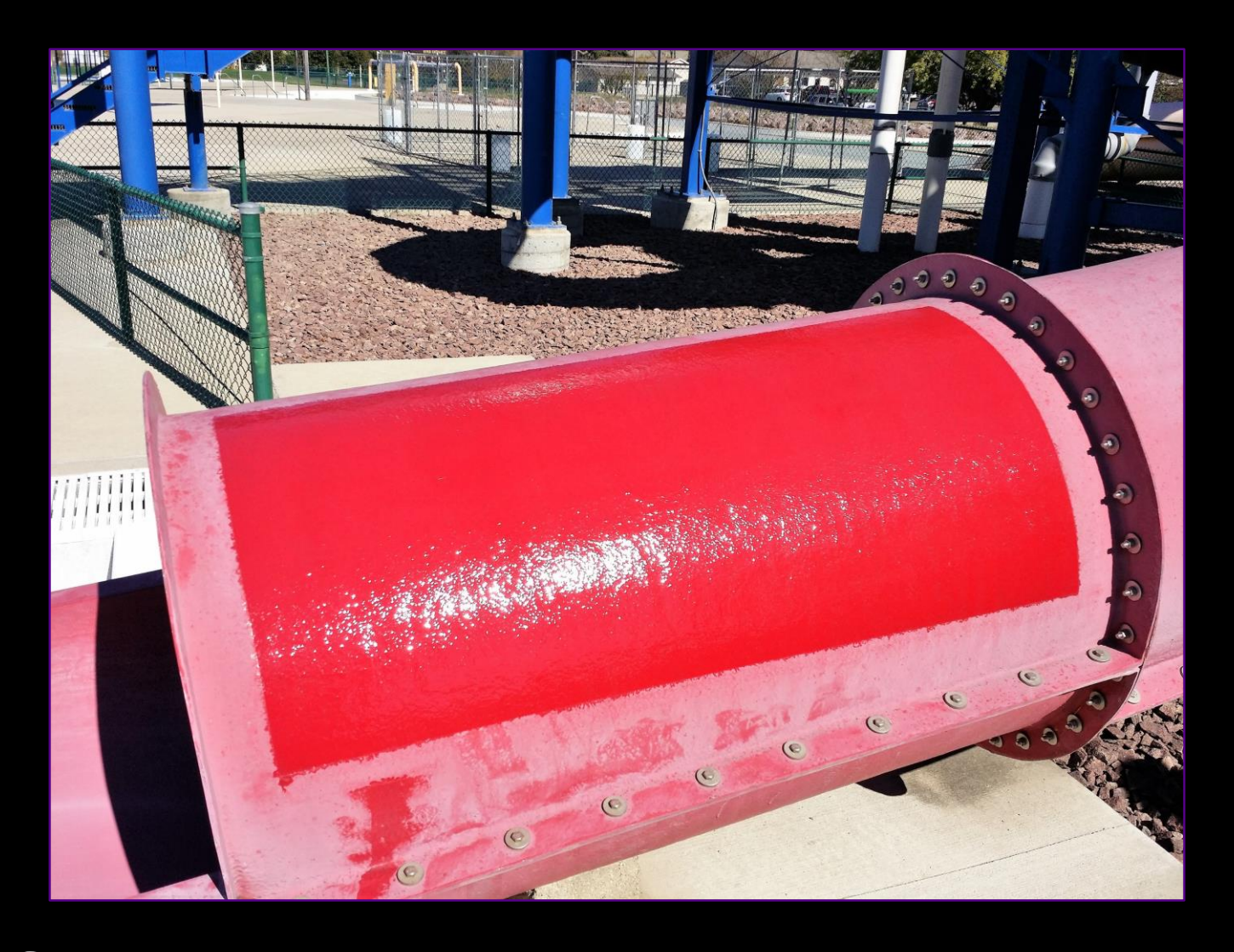
After Nano-Clear Application