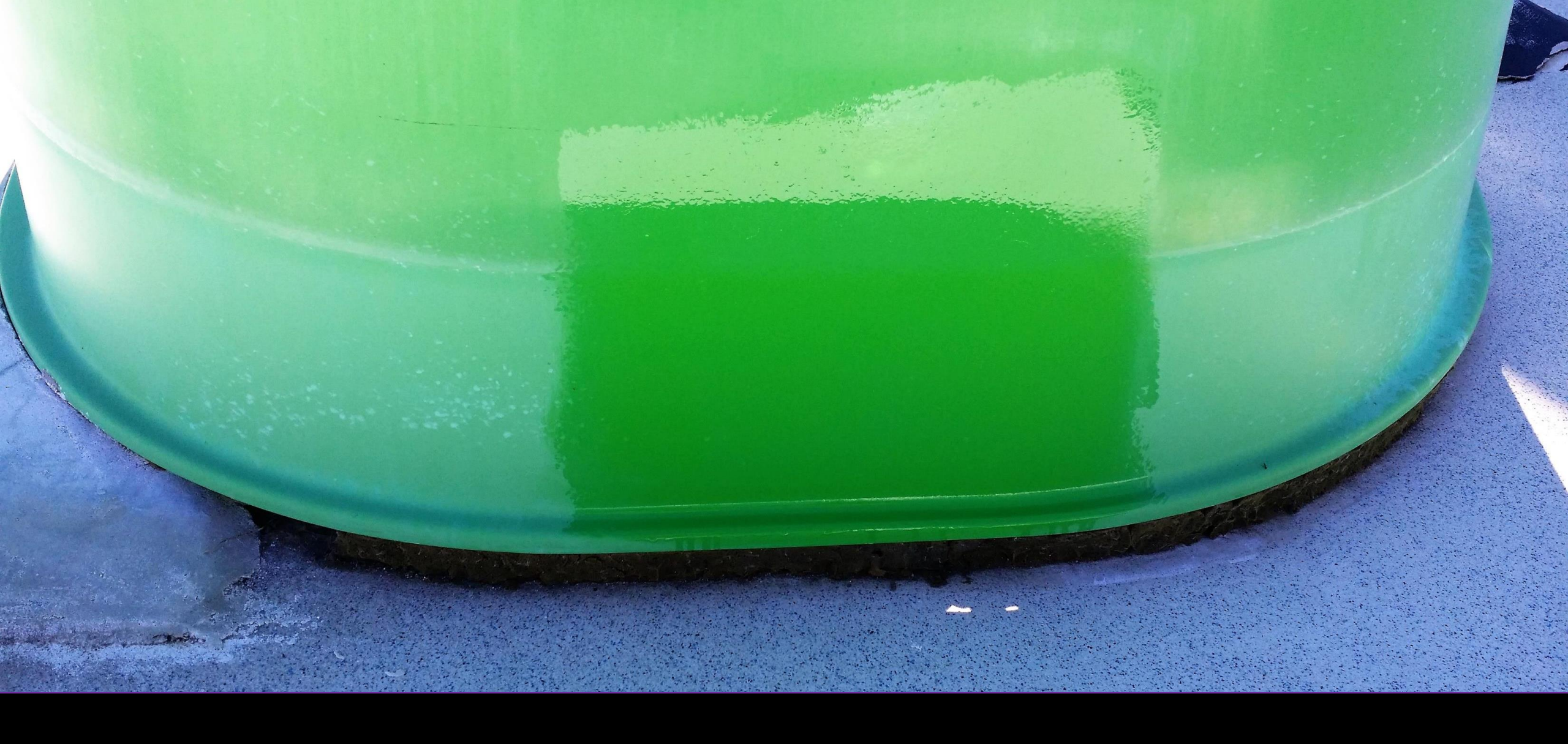
Small Green Slide After Nano-Clear Application